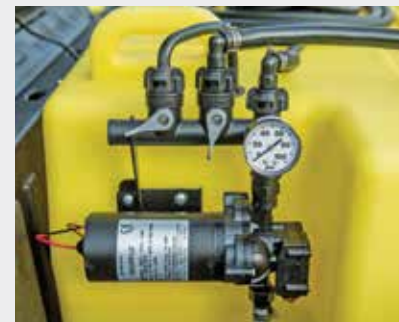
Pump & Manifold Assembly