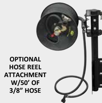
OPTIONAL HOSE REEL ATTACHMENT W/50' OF 3/8" HOSE