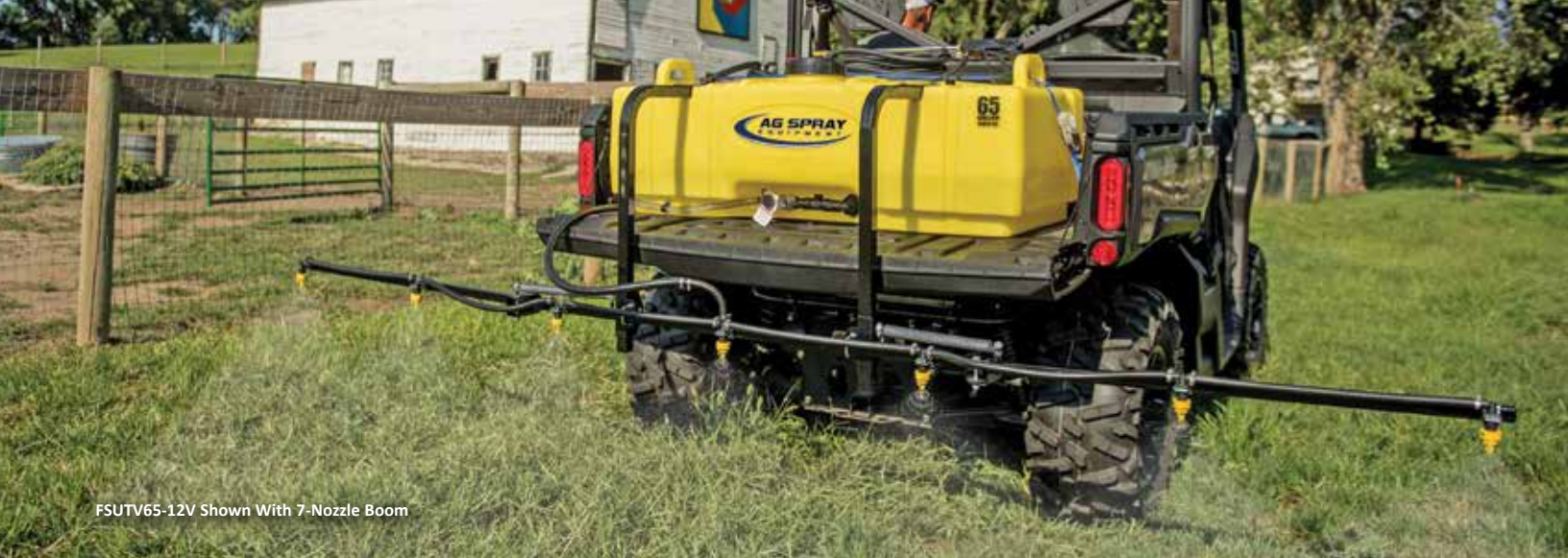
FSUTV65-12V Shown With 7-Nozzle Boom