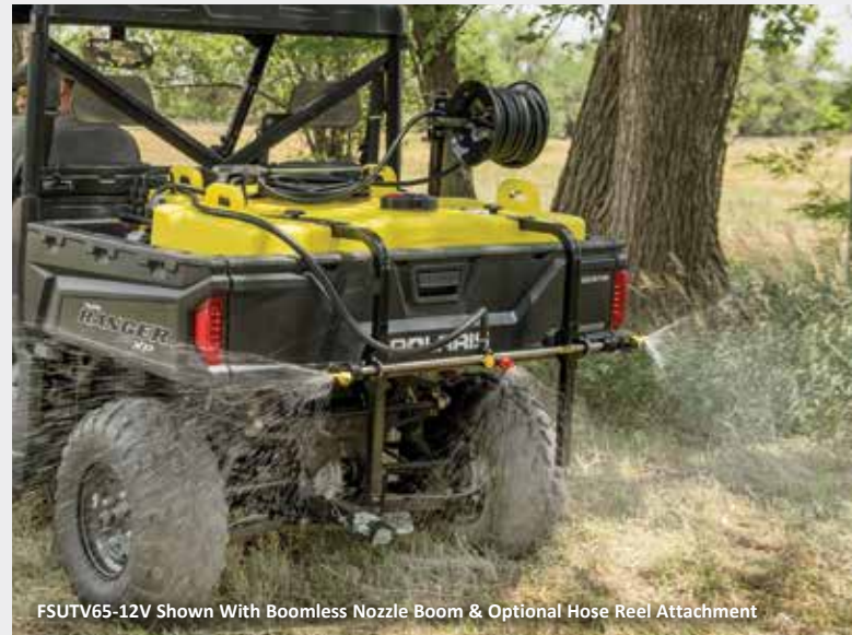
FSUTV65-12V Shown With Boomless Nozzle Boom & Optional Hose Reel Attachment