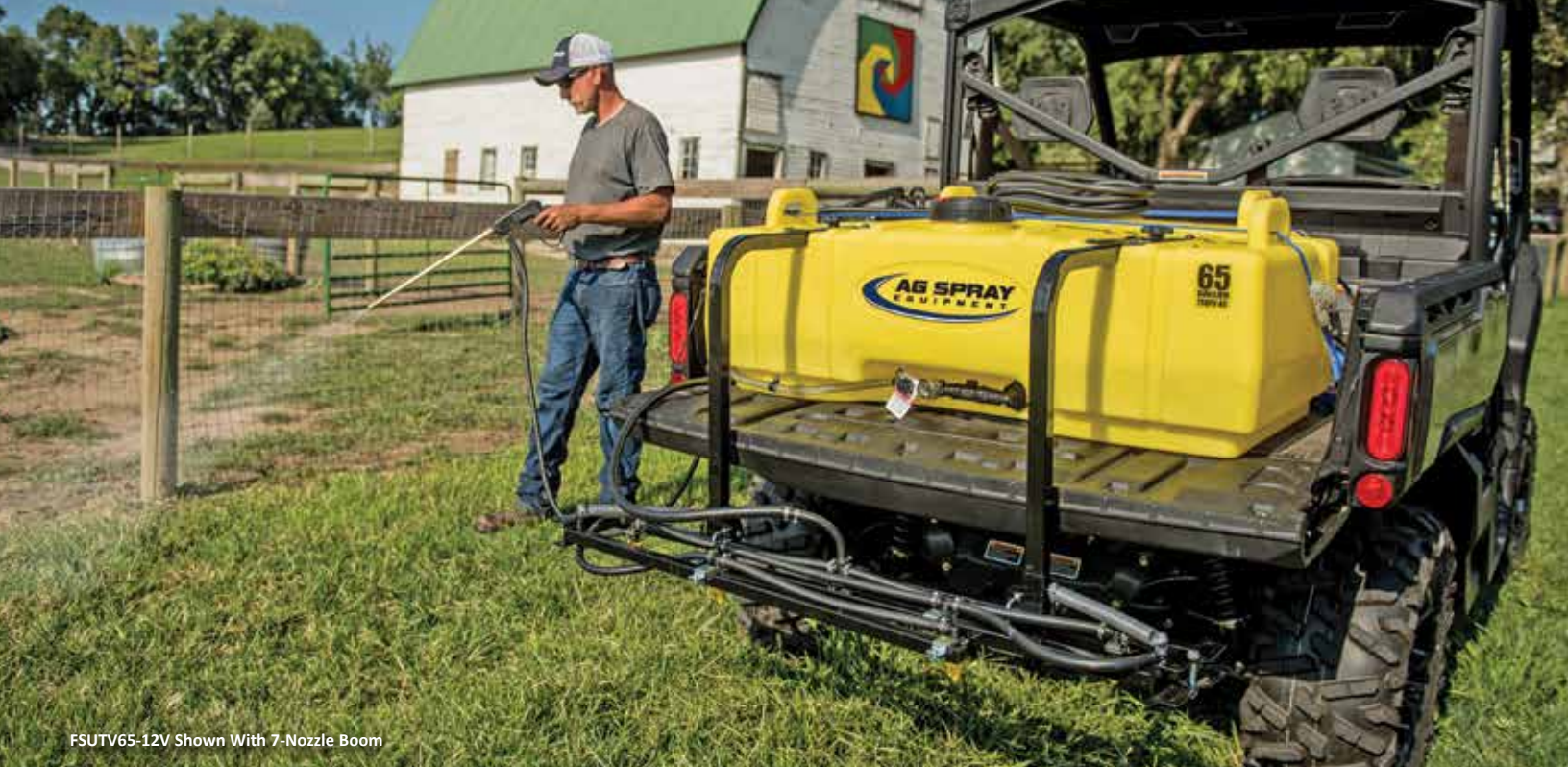
FSUTV65-12V Shown With 7-Nozzle Boom